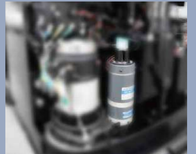
EPS (Electric Power Steering) is standard specification