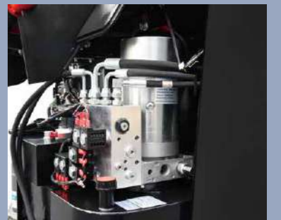
BUCHER hydraulic unit