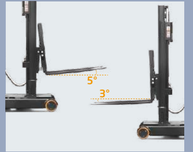
Fork tilt F/R: 3° / 5°