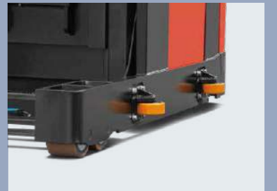
Rail guidance rollers (Opt.) can be fitted to the truck for VNA working