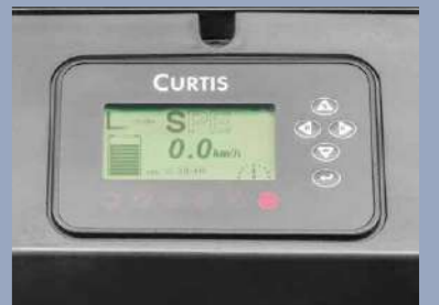
Standard LCD display informs the driver about all necessary informations