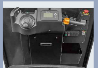
Control and display panel integrated are perfectly in the drivers field of view