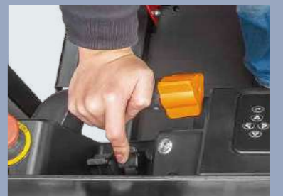
Simultaneous driving/lifting/lowering, simple and ergonomic controls allow precise operation reducing driver fatigue and increasing throughput