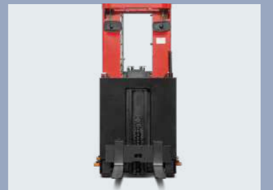
Supplementary lift on operator platform. Pallet can be raised to most convenient working level for picking